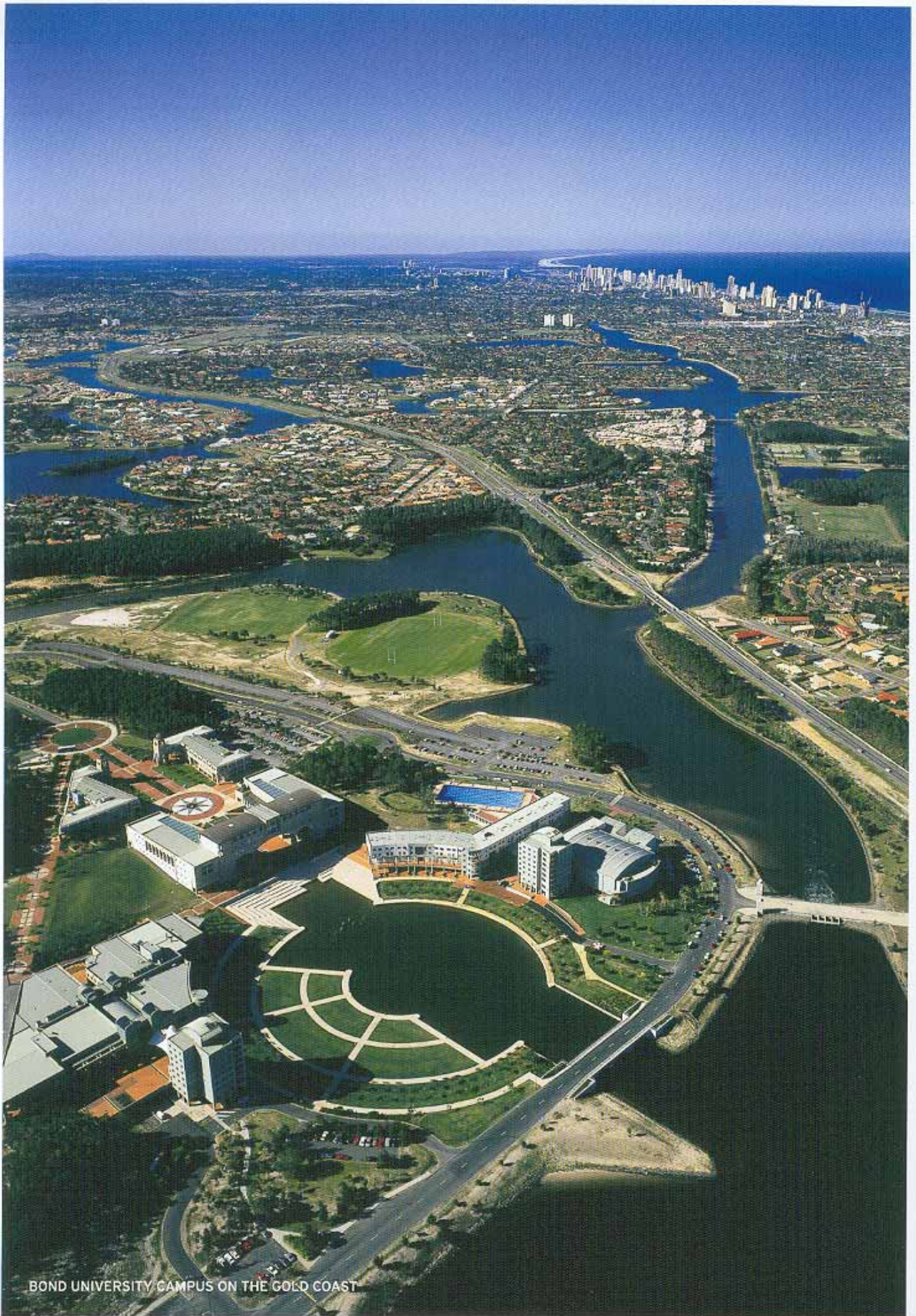
BOND UNIVERSITY CAMPUS ON THE GOLD COAST